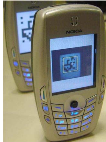
Figure 4 SiB application on a Nokia 6620 with one phone scanning the barcode on the LCD of another (see online version for colours)

The barcode format and image processing algorithm in our system is adapted from Visual Codes (Rohs and Gfeller, 2004). The data contained in the barcodes for SiB is augmented with Reed-Solomon error correcting codes to provide better performance in the presence of errors in the image processing (Reed and Solomon, 1960). We ported Karn's implementation of Reed-Solomon codes to Symbian OS (Karn, 2002). The SHA-1 cryptographic hash function is used for all hashing operations (Jones, 2001), and all wireless communication occurs via Bluetooth Haartsen (2000).