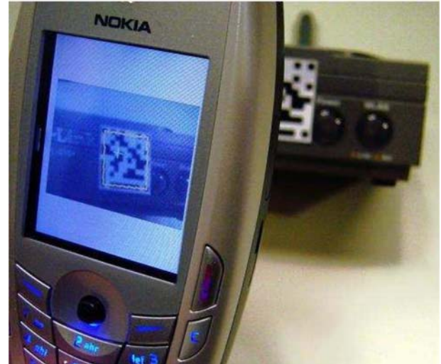
Figure 3 Phone running SiB scanning a barcode on an 802.11 access point (see online version for colours)

wireless communication with the printer or print server and bootstrap the establishment of a secure connection. Secure communication is important here not only to ensure the secrecy of the printed document, but to prevent a MITM attack used to inject malicious software onto the user’s computer by masquerading as a printer driver.